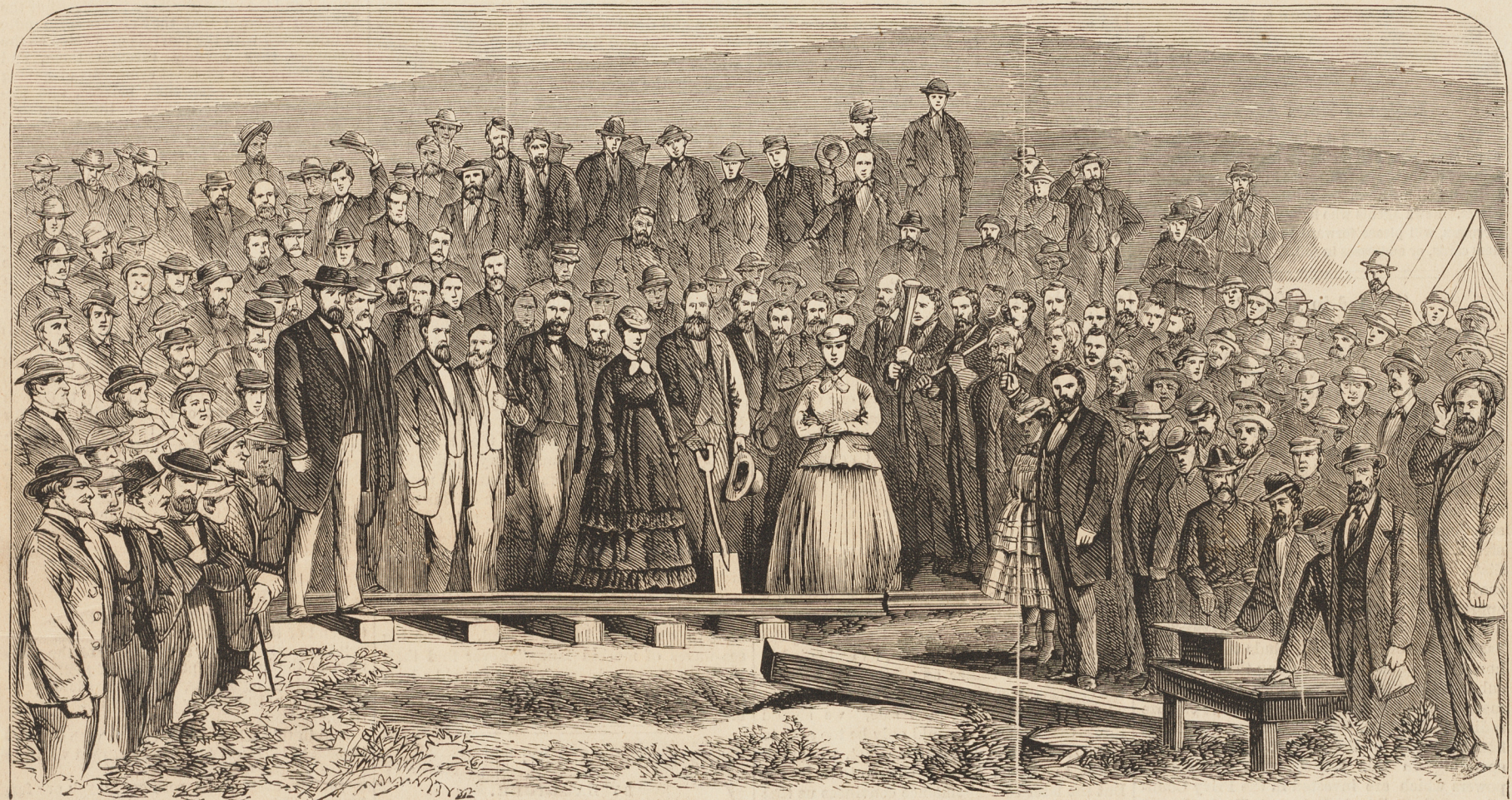
THE COMPLETION OF THE UNION PACIFIC RAIL ROAD—DR. DURANT AND GOV. STANFORD DRIVING THE LAST SPIKES, CONNECTING THE UNION AND CENTRAL PACIFIC RAIL ROADS, AT PROMONTORY POINT, UTAH, AT FIVE MINUTES PAST 3 P.M., NEW YORK TIME, MAY 10TH, 1869.—FROM A PHOTOGRAPH BY A. J. RUSSELL.—SEE PAGE 183.

[PRICE 10 CENTS. 13 WEEKS, $1 00. $4 00 YEARLY.]