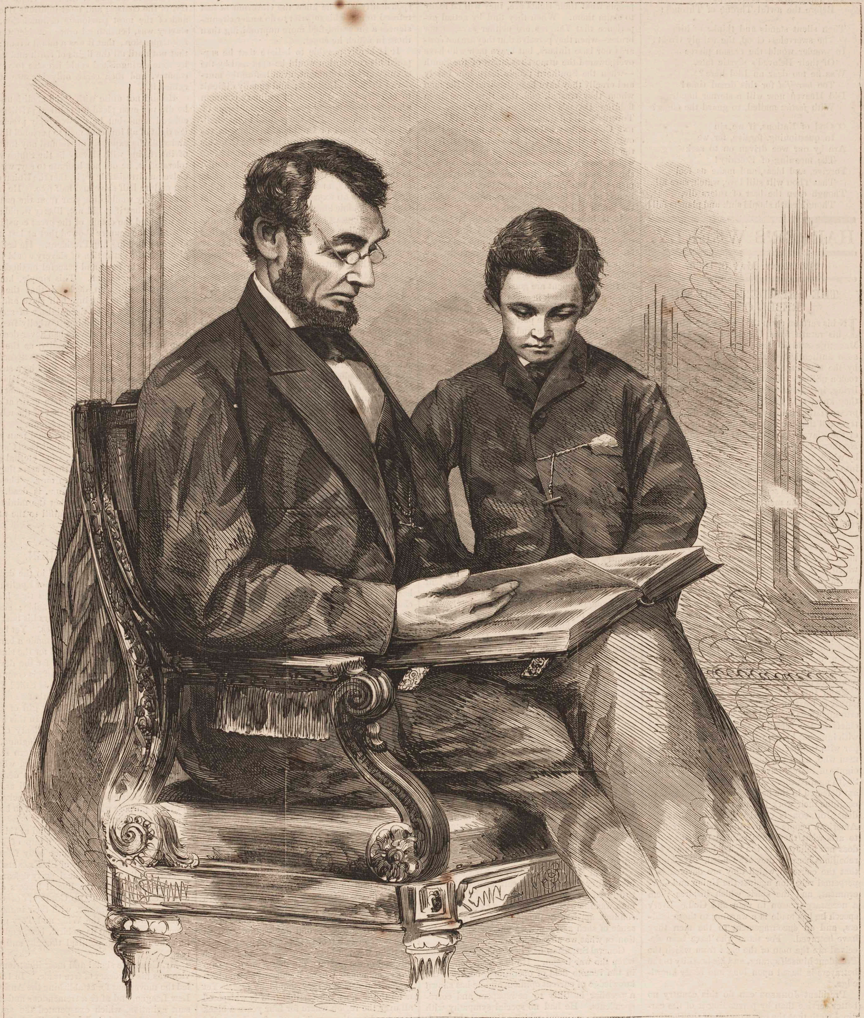
PRESIDENT LINCOLN AT HOME.

Entered according to Act of Congress, in the Year 1865, by Harper & Brothers, in the Clerk's Office of the District Court for the Southern District of New York.